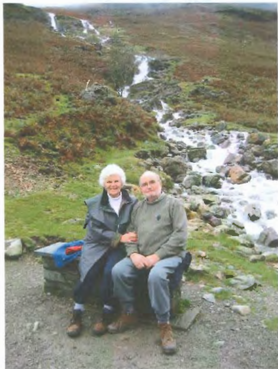
Taken on the banks of Buttermere on our Golden Wedding Anniversary on 12th October 2011