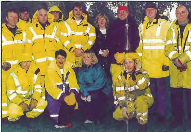
Taking time out for a team photograph before starting work at Marbury Park are the Manweb volunteers.

The Manweb volunteers wore Your Champions sweat shirts to publicise the forthcoming awards scheme which is run with Chronicle Newspapers and North Wales Independent Press.