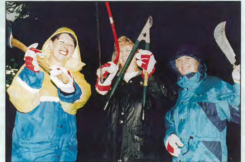
Right tools for the jobs – the Manweb workers were well equipped for their work on the land at Marbury Park.

The volunteers took an educational riverboat cruise on the River