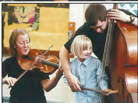
Right, a youngster is given an impromptu music lesson.