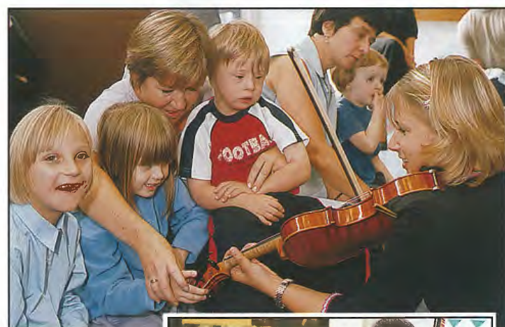
Above, a "Live Music Now!" musician plays to pupils and staff at Ysgol Powys.