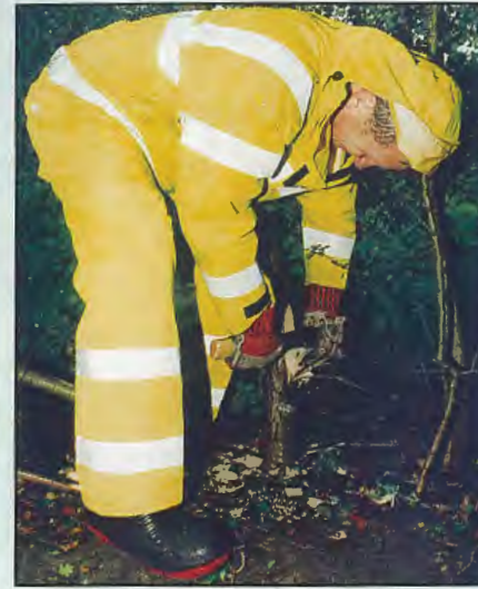
A volunteer shaves bark off a tree which will be woven into a hedge.