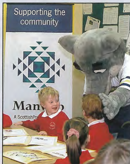
Warrington Wolves mascot Wolfie visits children at the Thelwall Infants School in Warrington.

Electro-Jet gives valuable advice and safety tips throughout the workbook on how to stay safe at home and at play.