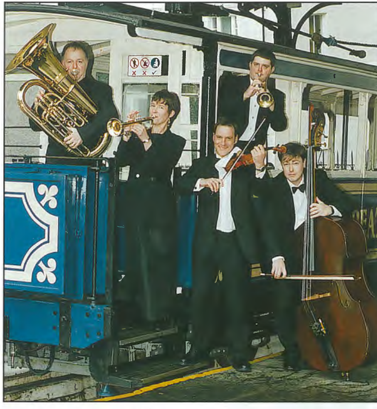
The Great Orme's alive with the sound of music - members of the Welsh National Opera pose for a photograph on board the Great Orme Tramway in Llandudno.