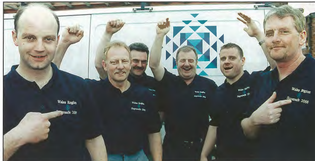
Wales Region staff wear the commemorative T shirts being sent out to mark the region's milestone of one year without a lost time accident in 2000.