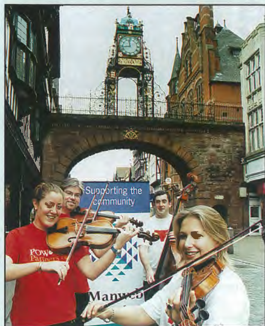
Graffiti Classics perform a charity concert in Chester City Centre.