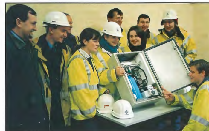
Manweb staff examine the birdscarer along with pupils from Morgan Llwyd school.

"The students have been extremely resourceful in finding a workable solution in a very short timescale.