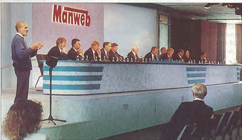
Sign language interpreting during the AGM.