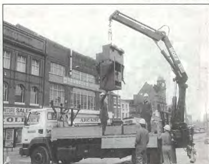
Up, up and away. The redundant switchgear is loaded onto a Manweb truck.