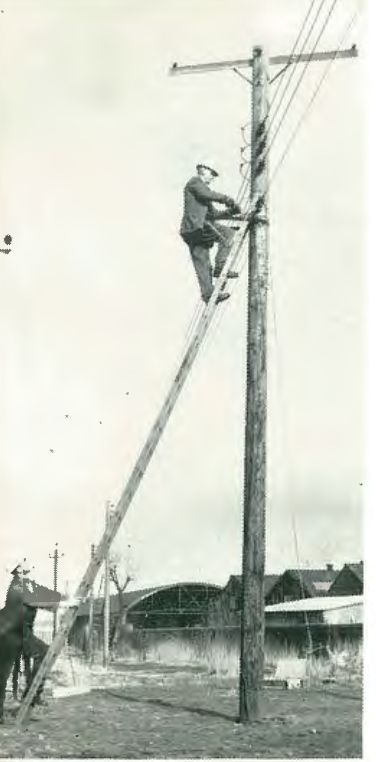
Above: Two members of the Clwyd District gang conducting a section pole low voltage live mains.

Below: Men from Anglesey District connecting a service to a chimney bracket.