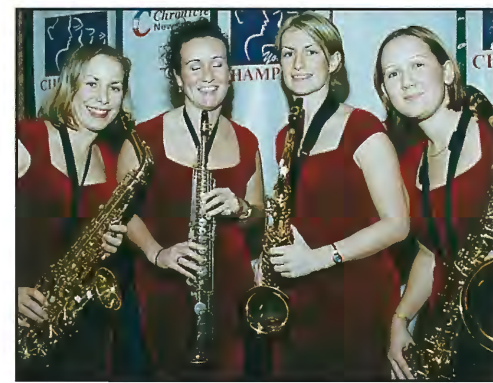
The Kintamarni Saxophone Quartet which performed at the Cheshire Awards.