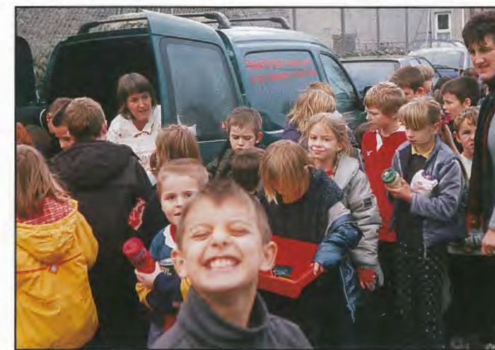
Primary schoolchildren queue up to deliver food to the Manweb ScottishPower Hamper Appeal van.