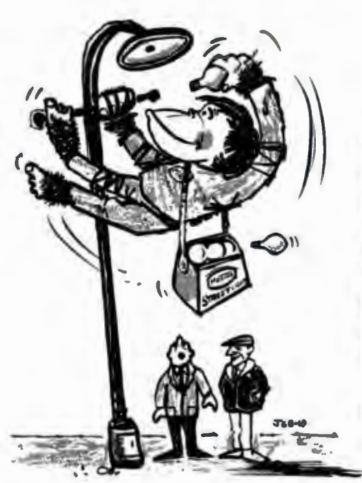
"We've heard of extra productivity but this is ridiculous!"