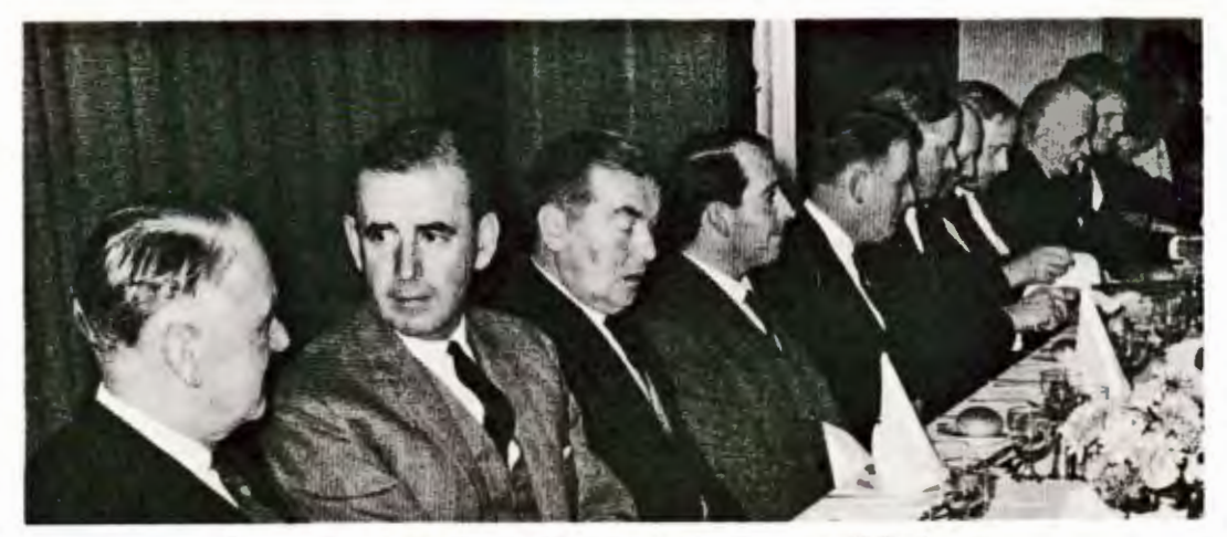
Conversation at the dinner table prior to the Chester staff Conference.