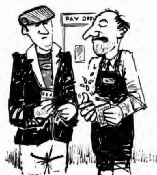
"Peanuts as usual Fred . . .

Following up on our feature "Old Moore's Tealeaves for 1969" which appeared in the Christmas issue of "Contact" our tame cartoonist