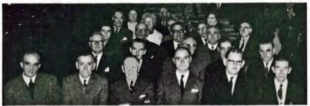
More members of the Area 1 staff who received their 35-year Long Service Awards.