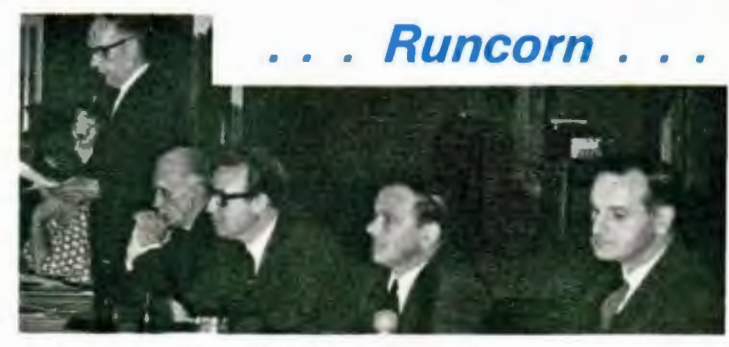
Mr. Mills addressing the Conference.

The Conference concluded with an Open Forum Session.