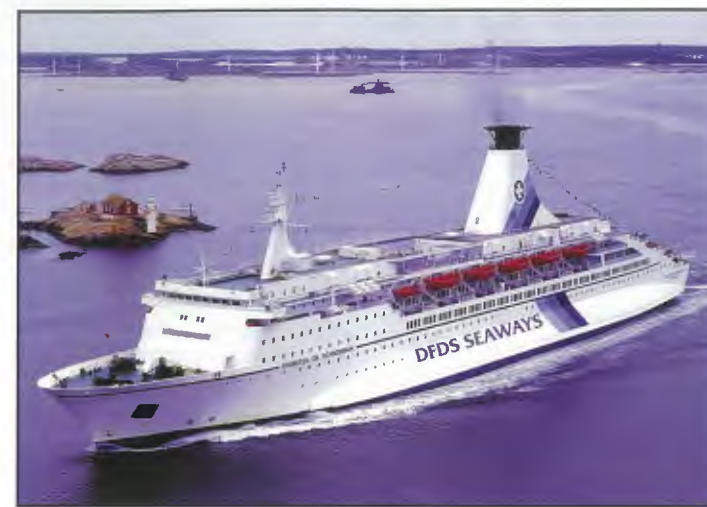
Sail away on the Princess of Scandinavia.

For the two-night break, with standard inside cabin with shower and wc, the cost is £53