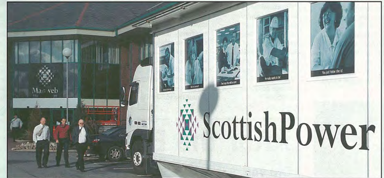
The Brandwagon parked outside Manweb House at Chester.