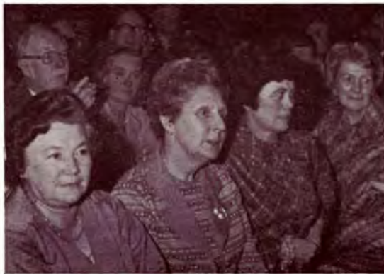
A section of the audience.