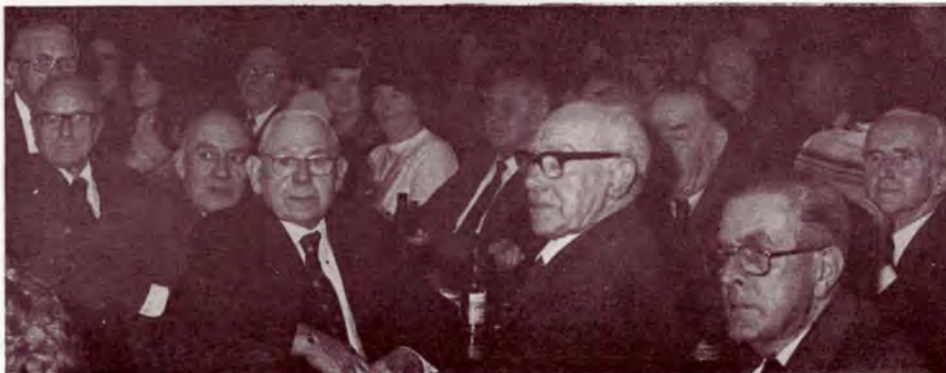
Liverpool delegates above and left, during their meeting