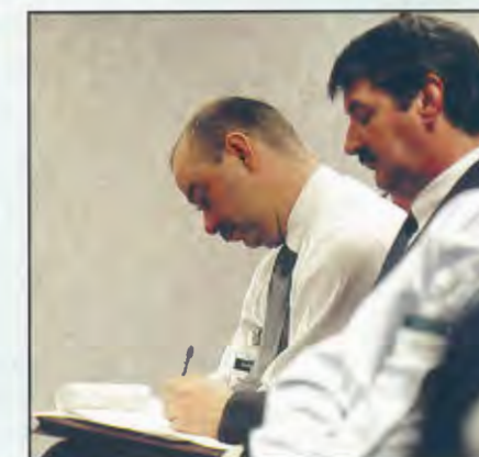
A businessman takes notes during the seminar at Hoylake House.