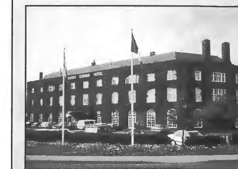
Quality Scotch Corner Hotel.